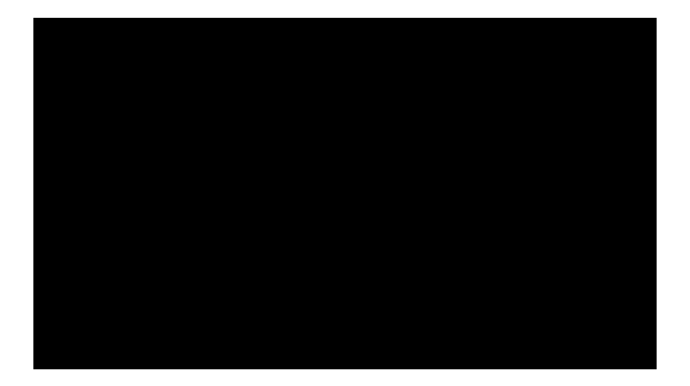
Click to View Video

These features make sure users receive the updates from the other Touters they follow.