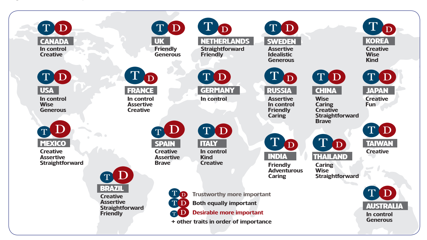
Figure 2: Personality Traits Associated with the Most Successful Brands

Some words, such as innocent and rebellious , tend not to be associated with the most successful brands. For example, the word innocent is often used as a descriptor for brands that are neither well known nor well defined, while the most successful brands (according to Bonding) tend to have strong clarity of associations. Similarly, rebellious brands are more likely to be seen as challengers than as leaders. In Taiwan, being seen as too straightforward can negatively affect Bonding, suggesting that in that country, cleverness is appreciated by consumers. Table 1 shows the countries for which each of these traits is negatively correlated with Bonding.